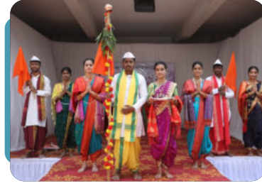
Art Fest & Traditional Events