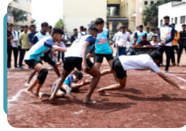
Annual Sports 2k25