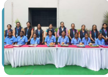
Women Empowerment Activities