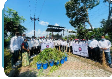
Social Activities by NSS & Social Club