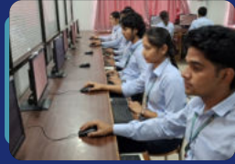
Training on Green Skill & AI