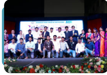
Glimpses of Annual Prize Distribution 2k25