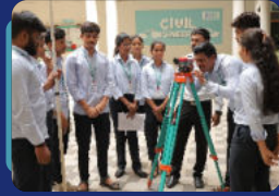
Hands on Sessions