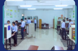
Well Equipped Labs