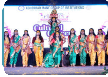
FUSION 2k25 Cultural Fiesta