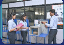
Learning at Incubation Centre